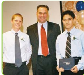
Former Governor Tim Kaine congratulates a C4K graduate and his mentor in 2003

Have you been looking for a way to get more involved in the local community? Do you or someone you know enjoy working with adolescents and computers? C4K is seeking volunteer mentors. Requirements include the desire to be a positive role model and basic knowledge of PCs or Macs and the Internet. Time commitment is only one hour per week over nine months. Volunteer trainings are held monthly. Visit www.computers4kids.net to fill out an application today!