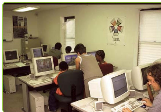
C4K's first Learning Lab on Grove St.