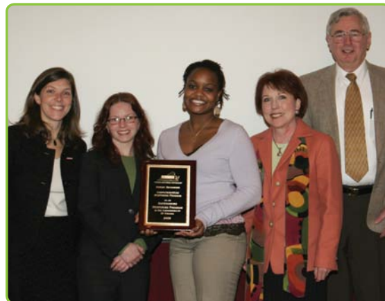
January 2006 - C4K Receives the Virginia Mentoring Partnership's Best Mentoring Program Award.