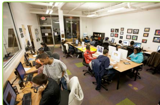
C4K moved into our current Learning Labs at the Frank Ix Building in March 2006.